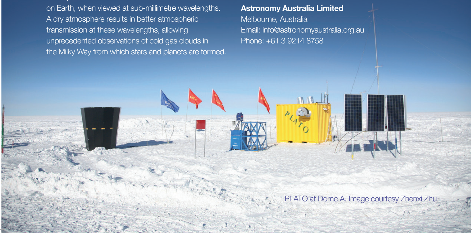
PLATO at Dome A.

Melbourne, Australia Email: info@astronomyaustralia.org.au Phone: +61 3 9214 8758